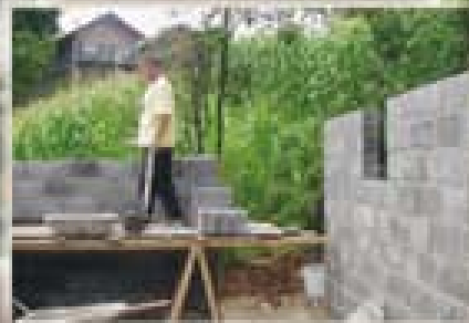
Building a small barn to help the family of a blind man in Kopice become self-reliant. Built with funds and staff support from Connecticut Friends of Bosnia and a donation from the soldiers of SFOR 14, the barn will house 50 chickens, 5 sheep, and a cow.