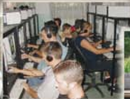
Students from Tuzla University at a computer center created by the Student Club for People with Special Needs and the Student Dorm Association. The center was created with over $20,000 in funding from CBD and employs 16 students and generates funding for student programs and is now entirely independent and self-sustaining.